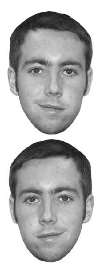
Figure 1 Example trial from the chimeric faces task.

with the mirror image presented either directly above or below (see Figure 1). The chimeric faces task was computerized and presentation controlled and randomized in Superlab. Participants were seated centrally to the computer and presented with 20 pairs of faces (formed from ten initial images) and had to decide which face looked happiest. Chimeric face task laterality quotients (CFT-LQ) were calculated giving scores of -1(always choosing the face with the positive expression in the right visual field which indicates left hemisphere dominance for the task) to +1 (always choosing the face with the positive expression in the left visual field which indicates right hemisphere dominance for the task).